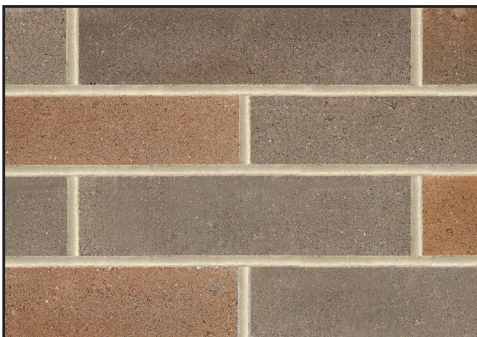
SAN ANTONIO BLEND